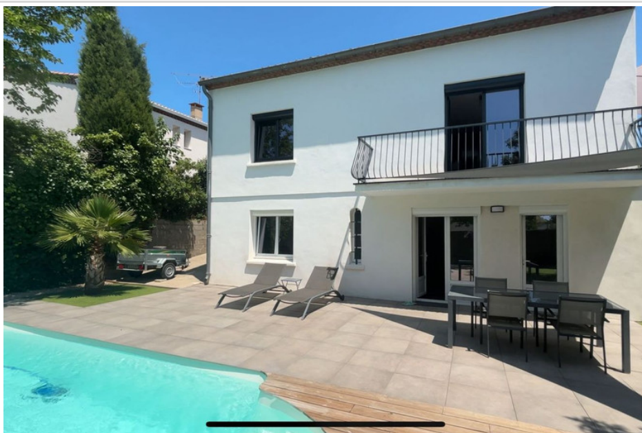
House 3456 Le Crès

Fees paid by the owner, no current procedure, information on the risks to which this property is exposed is available on georisques.gouv.fr .