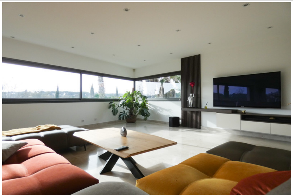
Villa 3312 Jacou

Honoraires à la charge du vendeur, aucune procédure en cours, information on the risks to which this property is exposed is available on georisques.gouv.fr